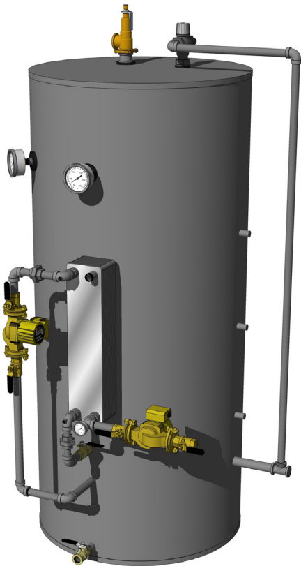
Unit shown with optional Boiler Water Pump and optional 3-way Tempering Valve.